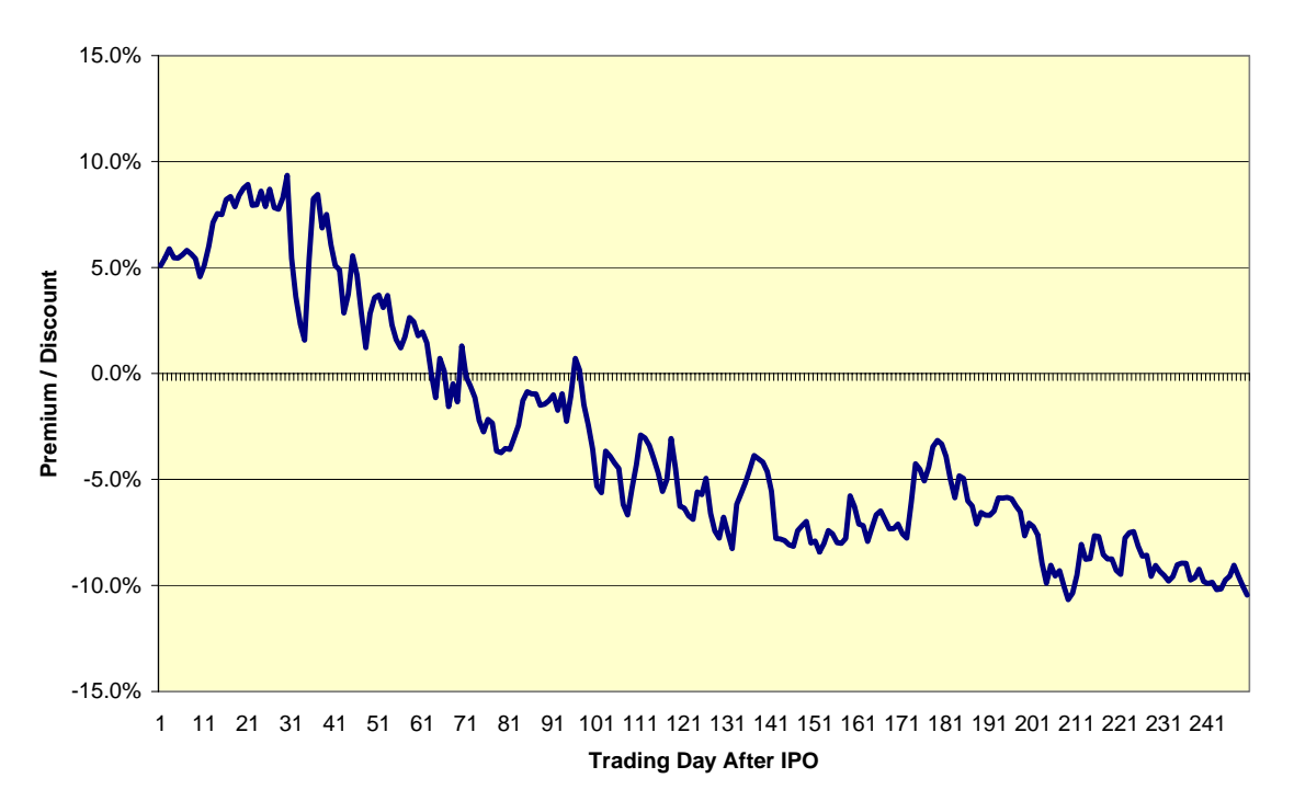
Figure 2: Evolution of Discount on Clough Global Opportunities Fund

Over this period, the price of the fund declined from $20 to approximately $18 per share. The objective of the fund as stated in the prospectus is total return. The fund invests in stocks and fixed income instruments of both US and foreign issuers. Figure 3 shows the performance of the Clough Global Opportunities Fund, the change in the Net Asset Value of the fund and two indexes: the MSCI World Index and the Lehman Aggregate Bond Index. By June 30, 2007, the price of fund shares had dropped by 10.8%. Over that same period, the NAV of the fund actually rose by 5%.<sup>8</sup> The Lehman Aggregate Bond Index was almost flat over this period, rising just 0.2%. The MSCI World index rose by 17%. It is intuitive that the performance of the underlying assets in the fund, tracked by the NAV of the fund, would be somewhere in between the global stock market index and the broad-based US bond market index since those asset classes are likely to be strongly represented in this portfolio according to the prospectus. The