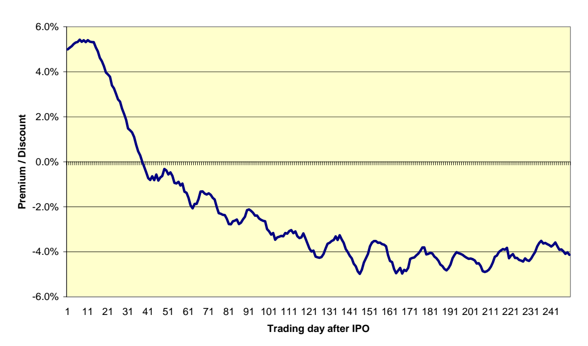
Figure 1: Evolution of Closed End Fund Premia and Discounts: First 250 Trading Days

underwriting fees generated from the issuance of closed-end fund IPOs over the period.<sup>6</sup> Figure 1 shows the evolution of the discount/premium price of closed-end fund shares in the 250 trading days after issuance. The figure presents the variable [(Price-NAV)-1].